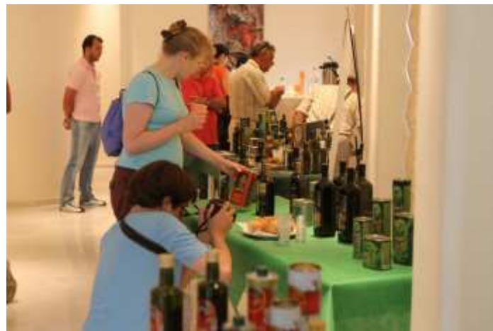
Photo during the press tour

The first day of the tour was dedicated to exploring the wine industry of the island. Therefore, there were several visits to the best-known Cretan wineries, such as the 'Douloufakis winery', located in the village of Dafnes, 'Gavalas', in Vorias village, and 'Tamiolakis', in Houdetsi village. All of them take part of the cluster 'Wine Roads