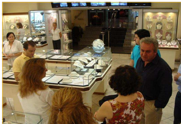
Tour in the city of Rhodes– Jewellery sector