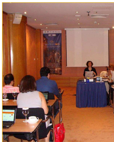
Presentation during the Steering Committee

These visits were an excellent opportunity to explore the famous Dodecanese Craft Tradition and to get acquainted with the current situation of the jewellery sector, its economic activity and the challenges and opportunities lying ahead to increase its competitiveness in the global market.